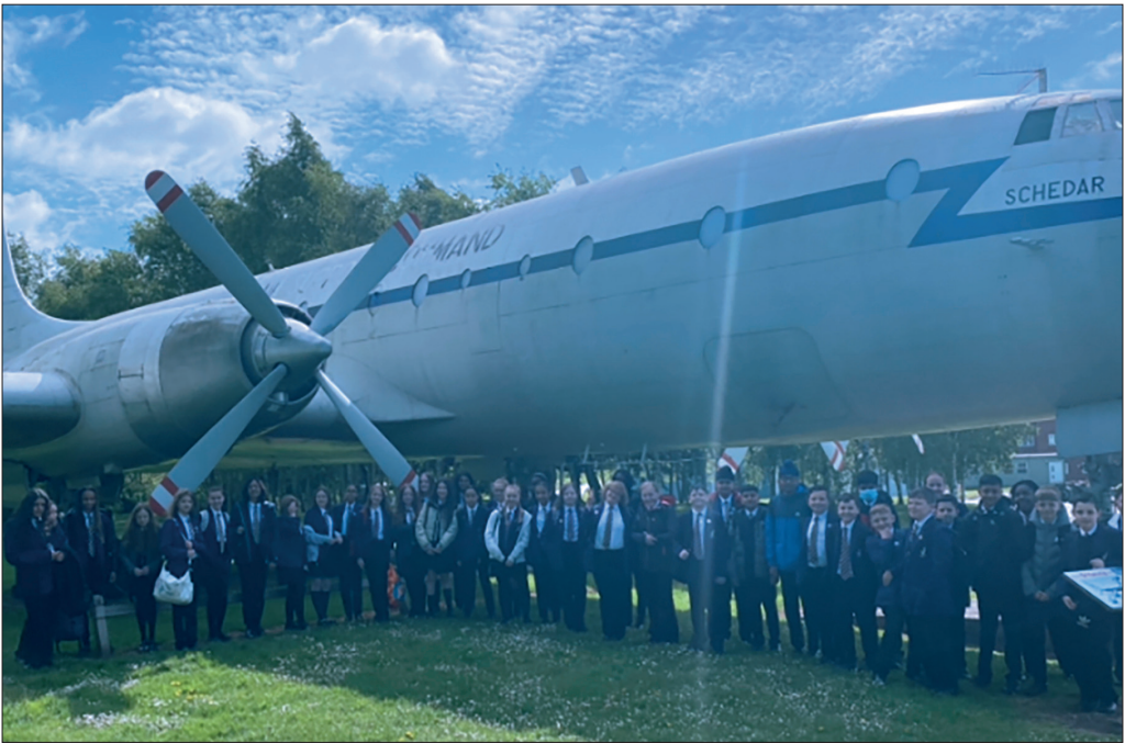
Excellence Academy – Year 7 visit to RAF Cosford