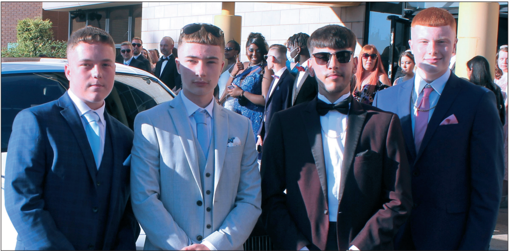
Year 11 Prom

“The teachers at Moseley Park are really helpful. I’ve settled into Moseley Park life really easily.”