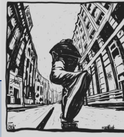
Unit 3: The Creative Process

Unit 7: Developing and Realising Creative Intentions External Unit