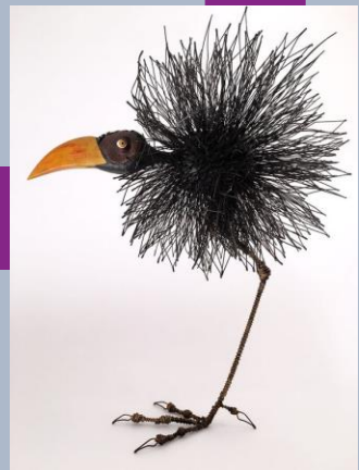
Our Planet – Endangered species (extinction expulsion)

Visit to Wild Zoological Park. Primary sources and research.