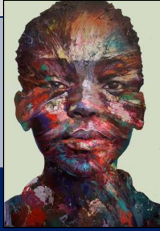
Portraits of Society

Preparation for next steps. Visiting HE venues and courses as opportunities arise.