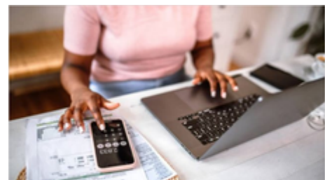
How much does university really cost?

Wednesday 21 January @ 16:30 UK time - 45 mins